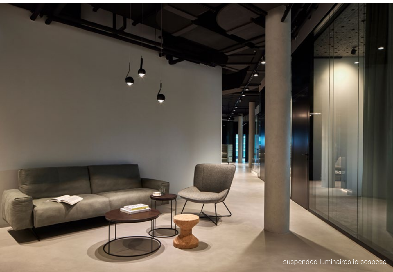
suspended luminaires io sospeso