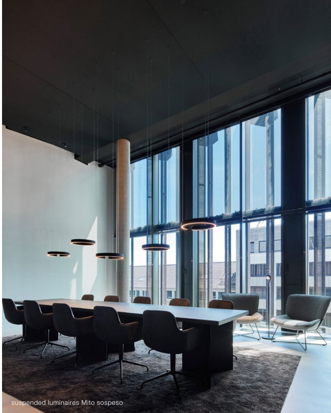
suspended luminaires Mito sospeso